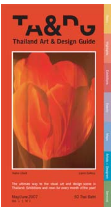
Front Cover Picture